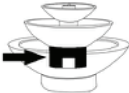
FT-131C (25 lbs) 11.5"W x 7"H

Note: Using the handle of a screwdriver or hammer works best to press the stopper in place.