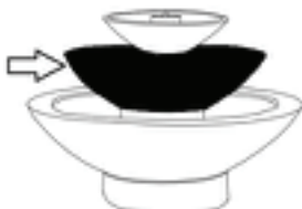
FT-131B (113 lbs) 29.25"W x 8"H

Step 6 - Place the pump house (FT-131C) over the pump and in the center of the Zen Bowl (P-502).