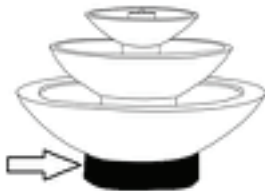
FT-131F (50 lbs) 18"W x 4.5"H

Three people are recommended for the installation of this fountain!