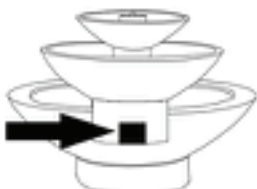
FT-131D (2 lbs) 5"L x 1.5"W x 4.75"H

Step 10 - Center the top bowl (FT-131A) over the middle bowl (FT-131B).