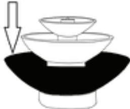
P-502 (198 lbs) 39.5"W x 9.75"H

Step 1 - Place the base (FT-131F) into position where the fountain will be installed, ensuring that it is level.