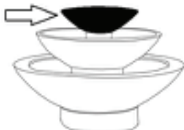
FT-131A (28 lbs) 18"W x 4.5"H

Step 8 - Center the middle bowl (FT-131B) over the pump house (FT-131C).