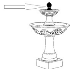
FT-191A (8 lbs) 5.25"W x 9.5"H