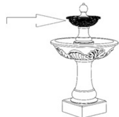
FT-191B (24 lbs) 16"W x 4.75"H