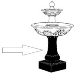
FT-191F (207 lbs) 15.25"L x 15.25"W x 27"H

Assemble your fountain on a level surface capable of holding a minimum of 456 pounds with an approximate 1.5 square foot footprint.