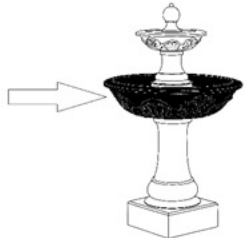
FT-191E (134 lbs) 32.5"W x 9"H