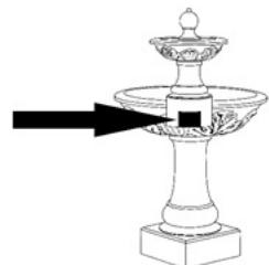
FT-191D (2 lbs) 5.5"L x 1.5"W x 4"H