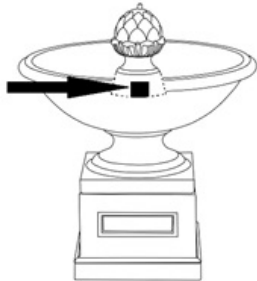
FT-282C (2 lb) 4.5"L x 1"W x 3.75"H