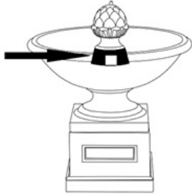
FT-282B (8 lbs) 8.5"W x 5"H