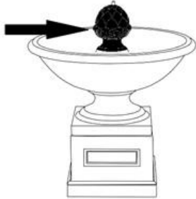
FT-282A (15 lbs) 6.5"W x 10.25"H