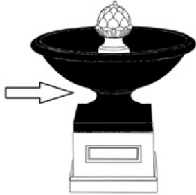
FT-282D (151 lbs) 29.5"W x 17"H