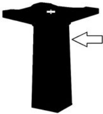
FT-107B (120 lbs) 18"L x 18"W x 25.5"H

Step 6 - Coil the pump cord in the pump house and push the pump down as far into the pump house as possible.