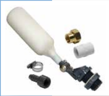
Auto Fill Kit #ABDAUTO

If algae forms on columns, brush off and use CrystalClear® Algae D-Solv® #PB2002 to quickly clear organic debris and remove odors. 1 ounce treats 360 gallons.