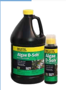
Algae D-Solv® #PB2002