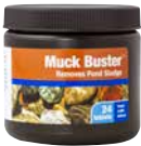
Muck Buster® #PB2682

DO NOT DRAIN THE BASIN FOR THE WINTER. It is best to keep the basin at least 50% filled with water to avoid heaving during freeze and thaw. Drain and refill in spring during your seasonal cleaning.