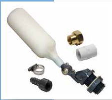
Auto Fill Kit #ABDAUTO