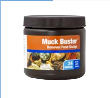
Muck Buster® #PB2682