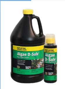
Algae D-Solv® #PB2002